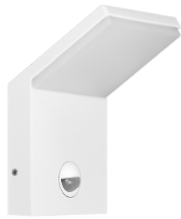
Neo XL sensor